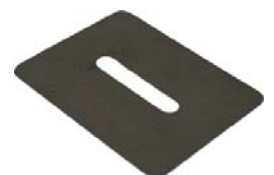
SLP - 1