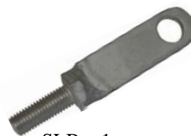
SLB - 1