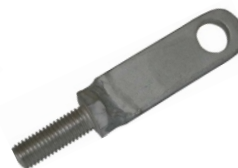
SLB - 1